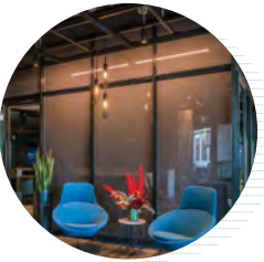
Ceridian Canada Ltd. LEED Gold