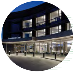
Bountiful Clinic: LEED Certified