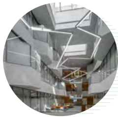
515 Post Oak LEED Silver