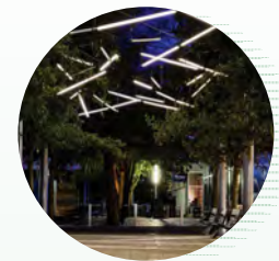
Discovery Green LEED Gold