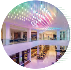
KPMG Lakehouse LEED Silver