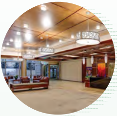
Huntsman Cancer Institute LEED Silver