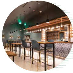
State Farm Arena LEED Gold & WELL Health-Safety Rated