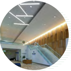
Alta View Hospital LEED Certified