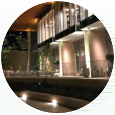
Wolf Point East LEED Silver