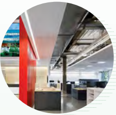
LPA Irvine Office Headquarters LEED Certified & WELL Health-Safety Rated