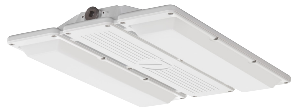
Visually Comfortable Acrylic Lens