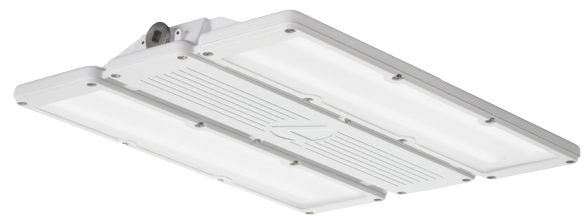
Diffuse Acrylic Lens