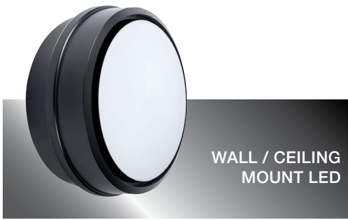
WALL / CEILING MOUNT LED