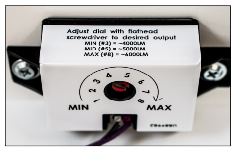
For ALO6 configurations