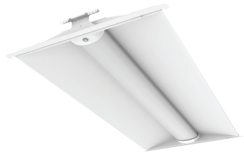
Optional Controls & Trim Shown