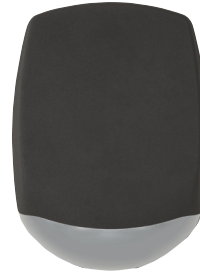
without photocell (dark bronze)