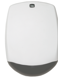
with photocell (white)