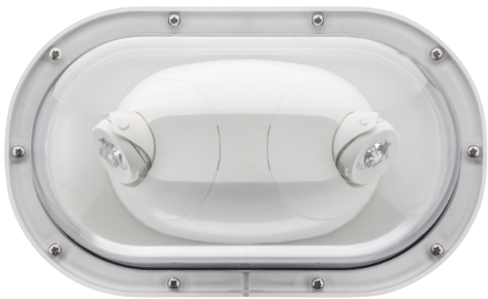
CZQRE LP220L T with CZWPVS SML W accessory for wet locations and vandal protection

Notes 1 For twin (T) remote, multiply lumens and watts by 2.