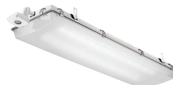
Industrial & Outdoor