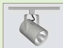
JUNO® TRAC-MASTER® T285L TRAC HEAD

The Bluetooth® word mark and logos are registered trademarks owned by Bluetooth SIG, Inc. and any use of such marks by Acuity Brands is under license. Other trademarks and trade names are those of their respective owners.