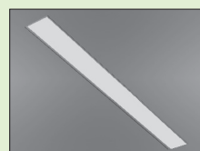
MARK ARCHITECTURAL LIGHTING™ SLOT 6