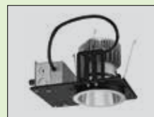
GOTHAM® INCITO™ 4"