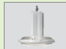
HOLOPHANE® HIGH BAY