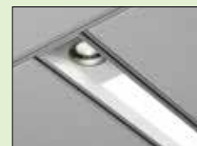
MARK ARCHITECTURAL LIGHTING™ SLOT 4 AND 6