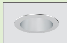
GOTHAM® EVO® 2" ROUND DOWNLIGHT