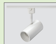
JUNO® TRAC-LITES™ R605L