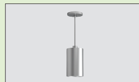
GOTHAM® EVO® 2" ROUND PENDANT MOUNT CYLINDER

The Bluetooth® word mark and logos are registered trademarks owned by Bluetooth SIG, Inc. and any use of such marks by Acuity Brands is under license. Other trademarks and trade names are those of their respective owners.