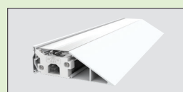
MARK ARCHITECTURAL LIGHTING™ MARKCOVE 504