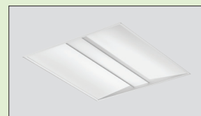
MARK ARCHITECTURAL LIGHTING™ WHSPR TROFFER