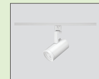
JUNO® TRAC-LITES™ R620L

The Bluetooth® word mark and logos are registered trademarks owned by Bluetooth SIG, Inc. and any use of such marks by Acuity Brands is under license. Other trademarks and trade names are those of their respective owners.