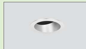
GOTHAM® INCITO™ 2" ROUND ADJUSTABLE DOWNLIGHT