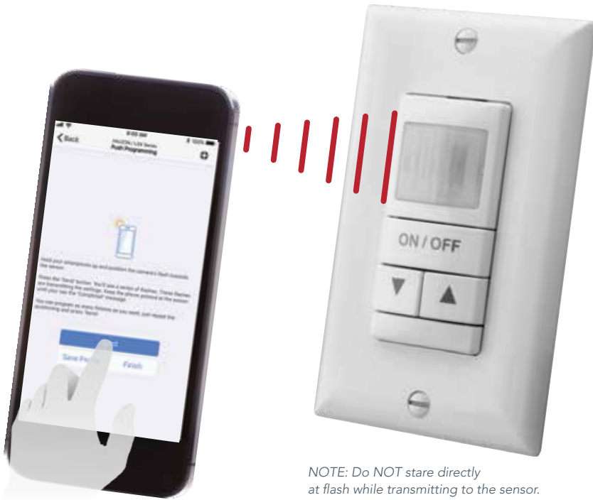
NOTE: Do NOT stare directly at flash while transmitting to the sensor.