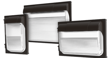
TWX LED Wall Packs

Choose a contemporary style with the low-profile form of the TWX wall-packs that cover the footprints of a typical HID wall pack and deliver up to 13,850 lumens.