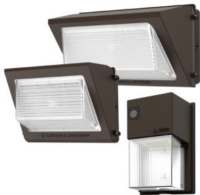
TWR/TWS LED Wall Packs

Choose a traditional style with TWR and TWS wall packs to match the legacy HID look with the added benefits of upgraded performance and features and provides exceptional energy savings.