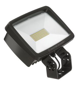
TFX2 with Yoke Mount