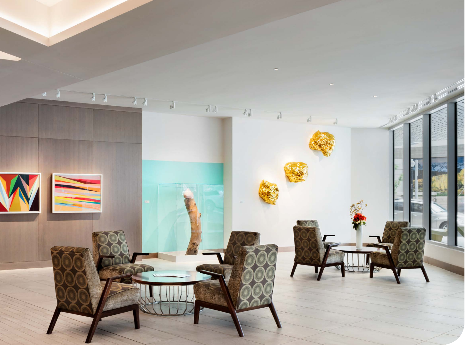
The Art Hotel, Denver, Colorado